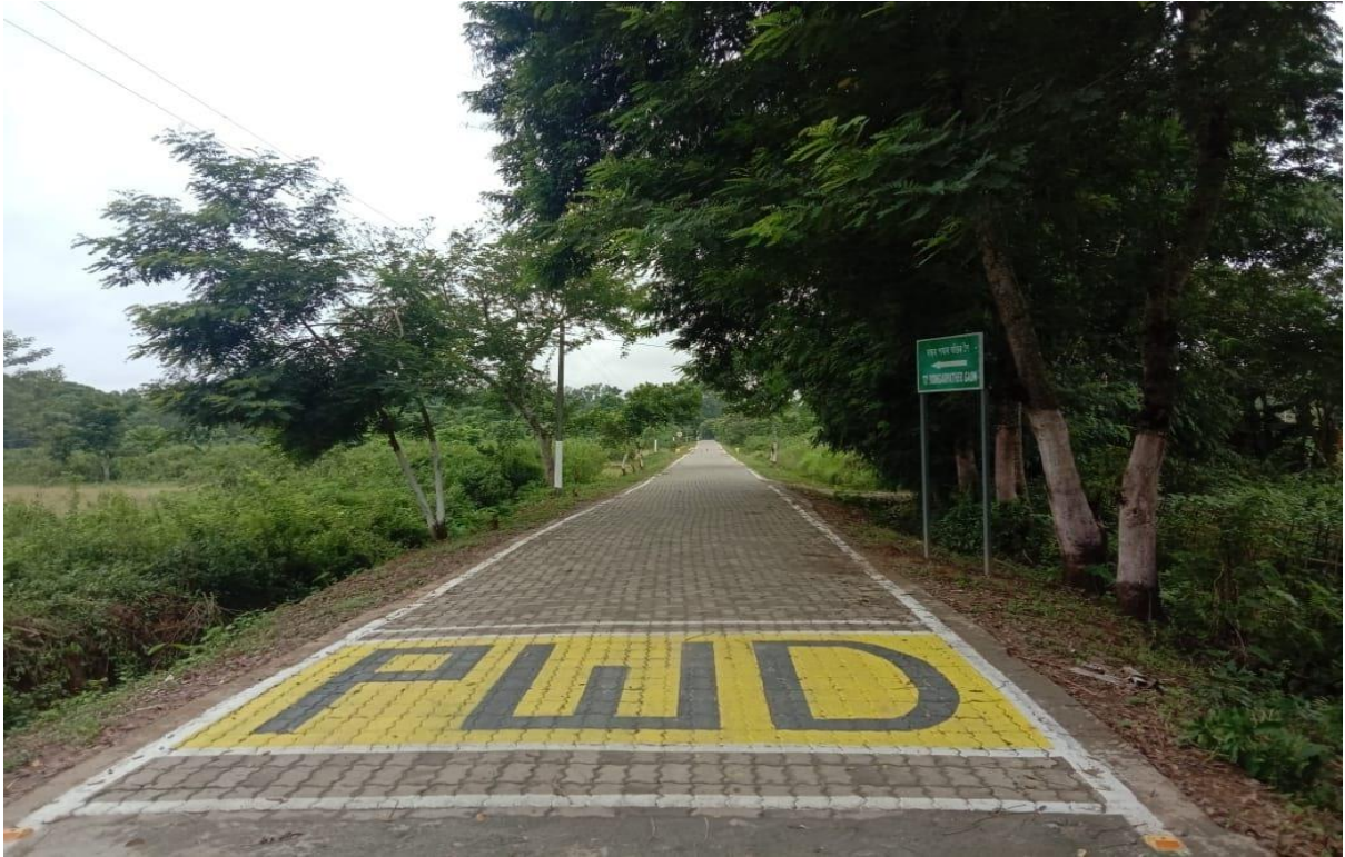
Dongapother Road under SOPD-G Work Completed