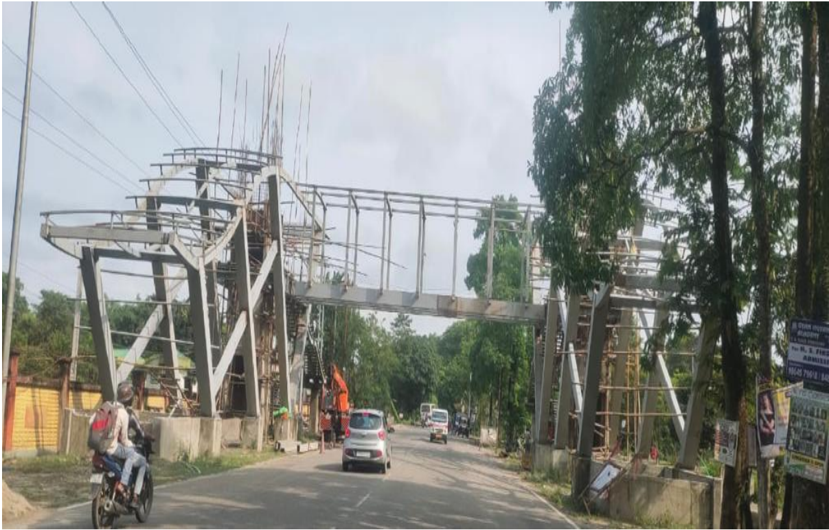
Built up Girder (BUG) in superstructure of FOB over old NH-37, at Dibrugarh University Entrance Work in Progress