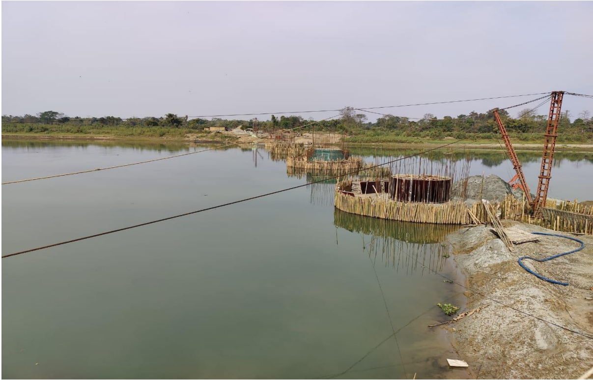
RCC Bridge connecting Chachani Belbari Ali and Tikirabalighat over river Buridihing under SOPD-G Work in Progress