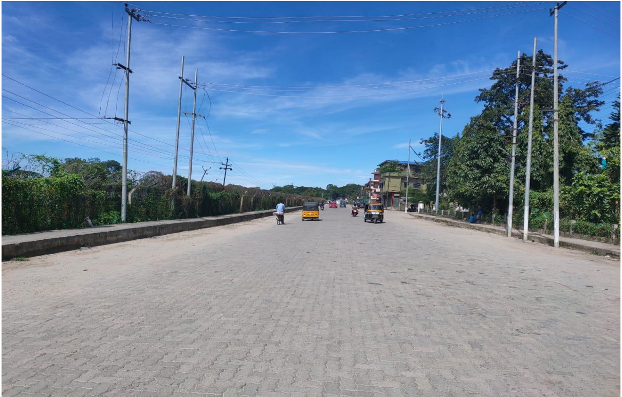
NH-37 to AMC under CRF