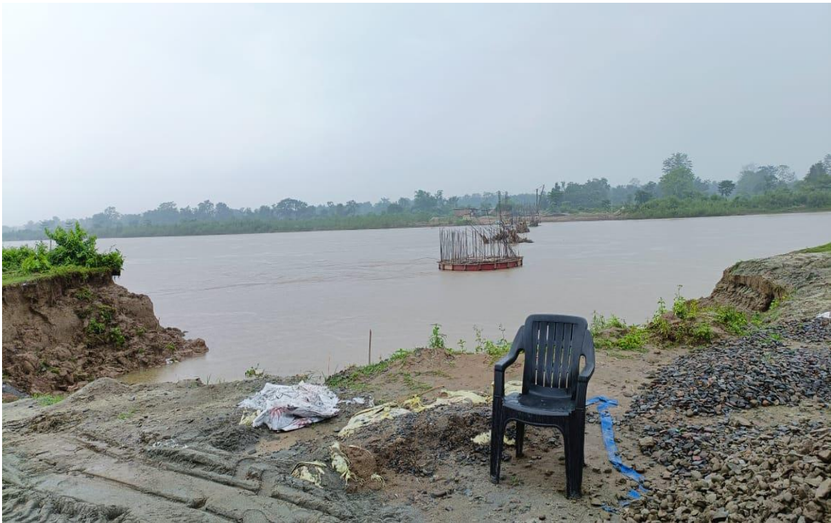
RCC Bridge connecting Chachani Belbari Ali and Tikirabalighat over river Buridihing under SOPD-G Work in Progress