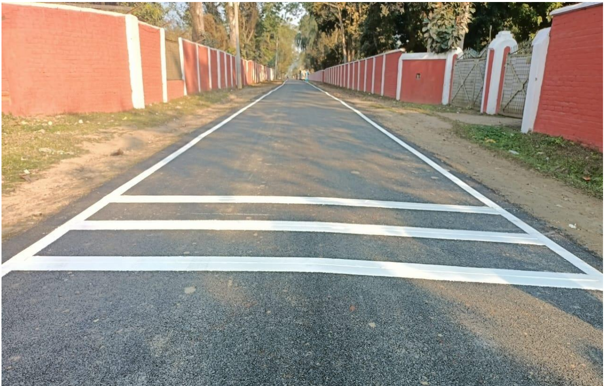
Mohanbari Hazelbank Road under SOPD-G Work Completed