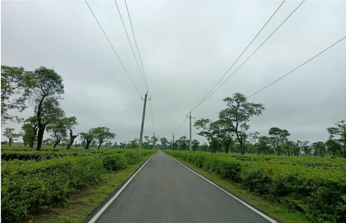
Maijan Thakurbari to Mukalbari Road under Signature Project Work Completed