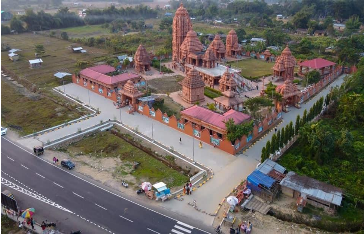
Jagannath Temple Road under Asom Darshan