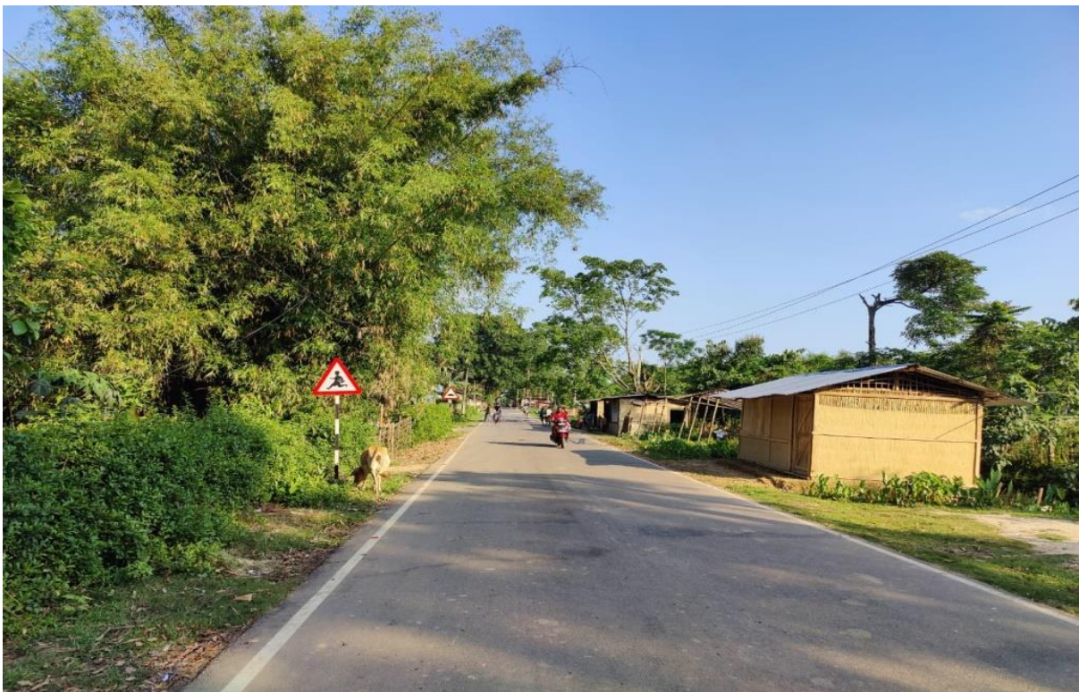
Nadua Oakland Road under RIDF-XXVI