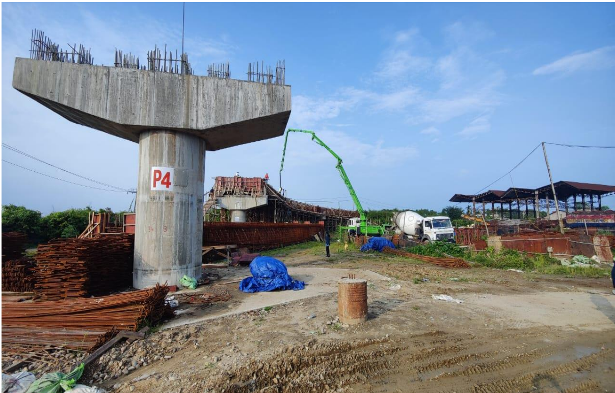
P-4, Pier-4 of Flyover at Junction Point of Convoy Road with NH-37 leading Amulapatty near Jalan Bus Terminous, Dibrugarh