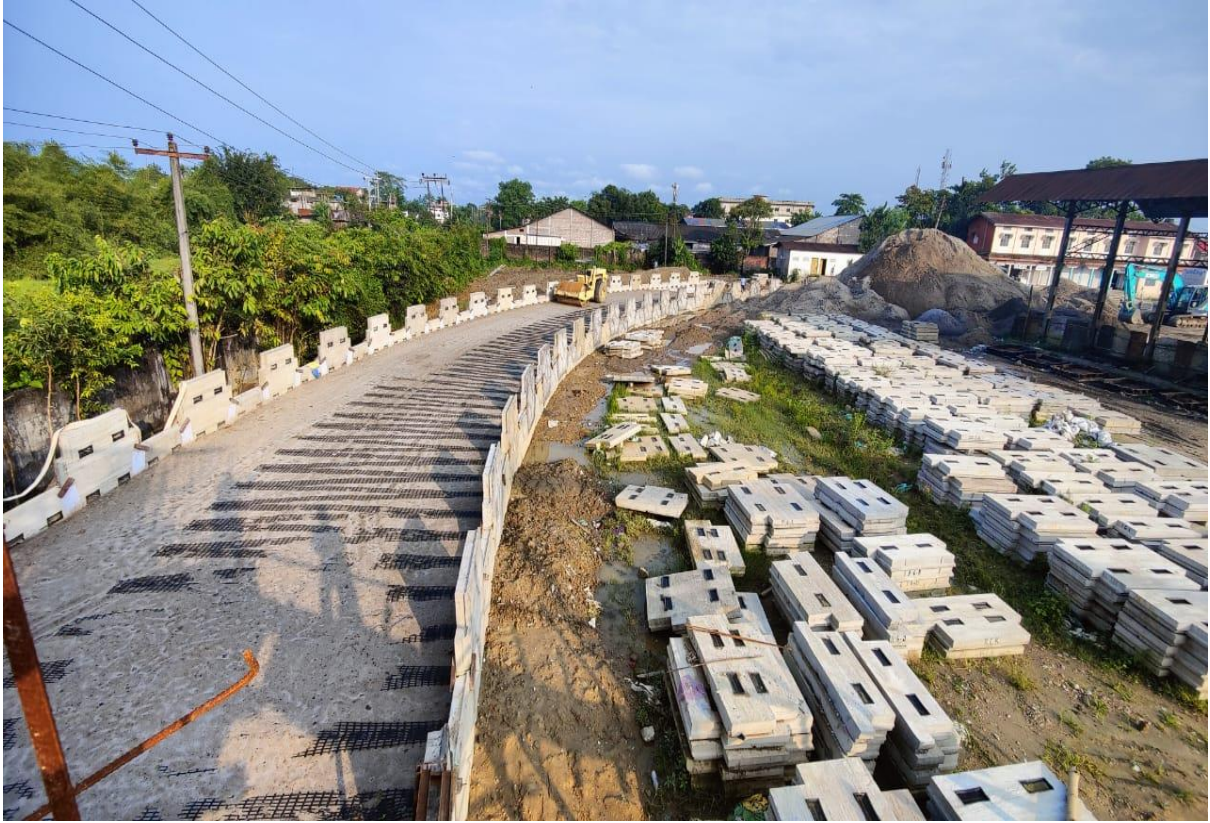
Casting of RCC RE wall at Junction Point of Convoy Road with NH-37 leading Amulapatty near Jalan Bus Terminous, Dibrugarh