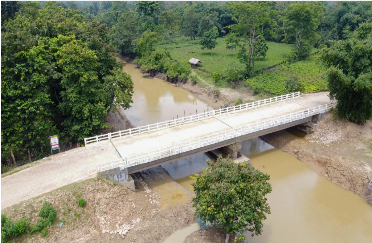
Br. No. 2/1 on Gazpuria Ali to Lukumari Demow Kinar Bongali under PMGSY Work Completed