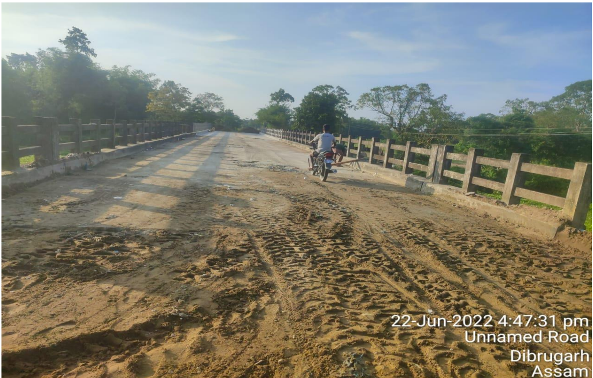
Extension of RCC Bridge No 19/1 on Mancota Bamunbari Road under CRIF