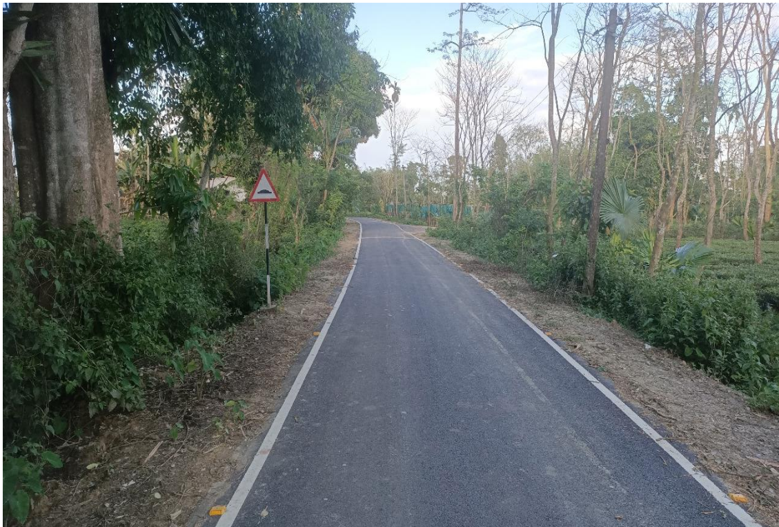
NH-52B to MN Road via Saguneswa No 1 under PMGSY Work Completed