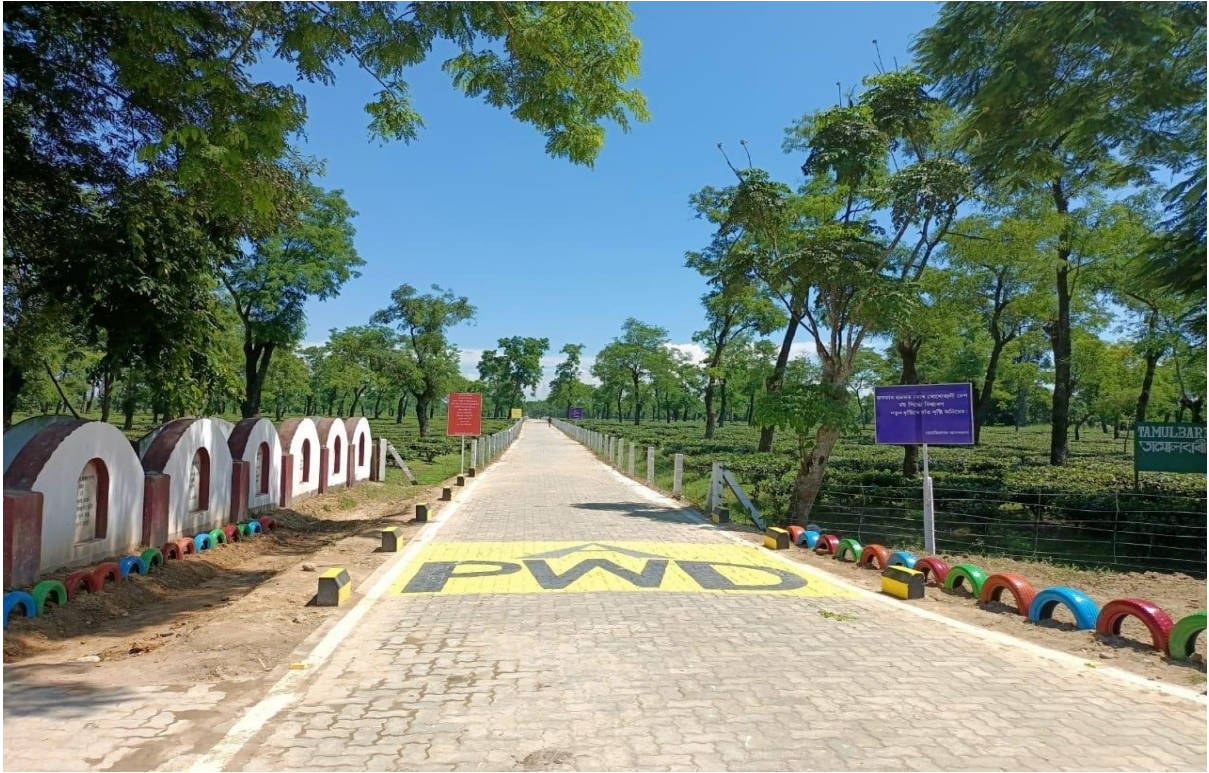
Tamulbari T.E. Road under SOPD-ODS Work Completed