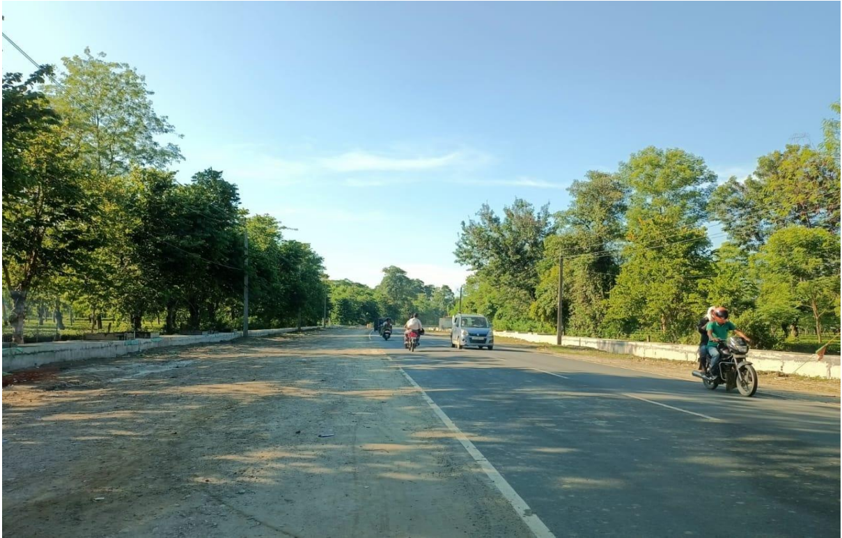
Mancota Bamunbari Road under CRIF