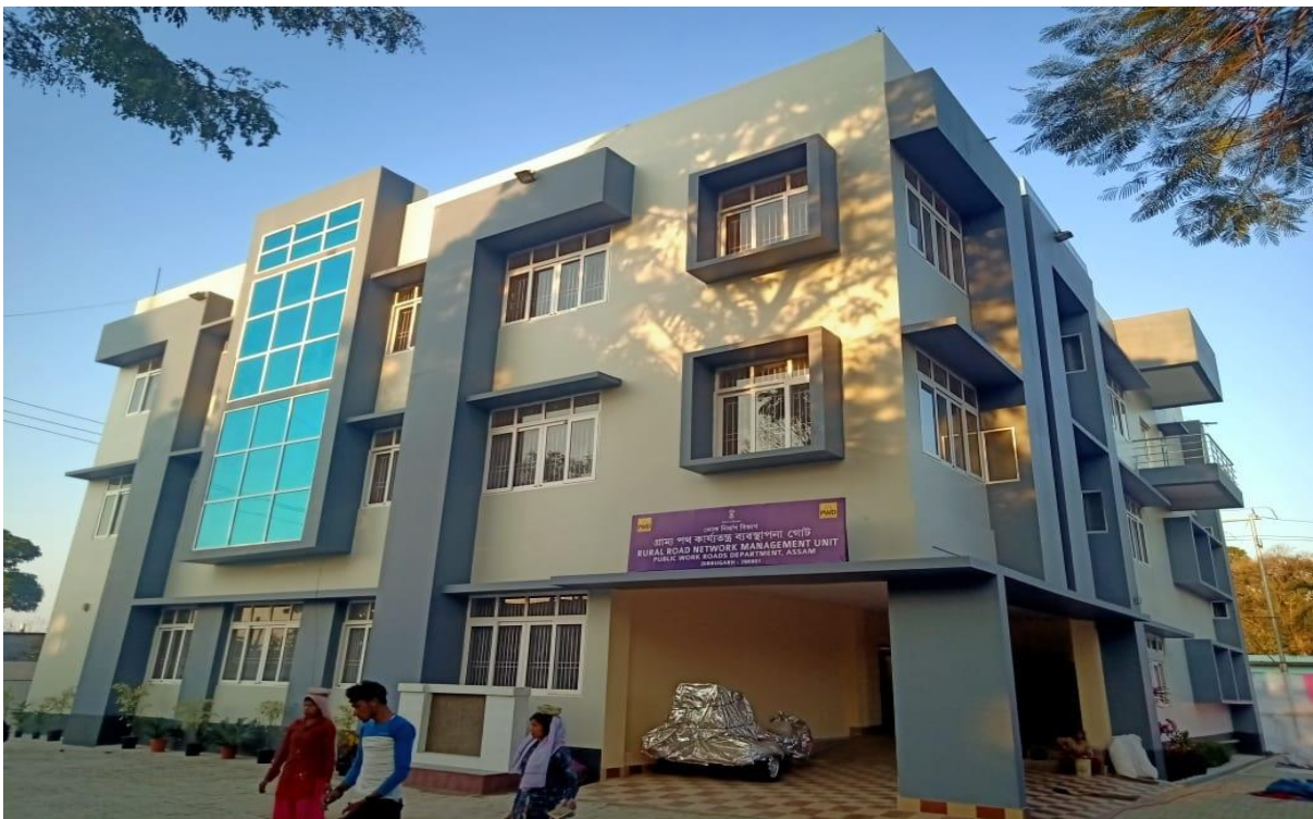
RRNMU Building under PMGSY Work Completed